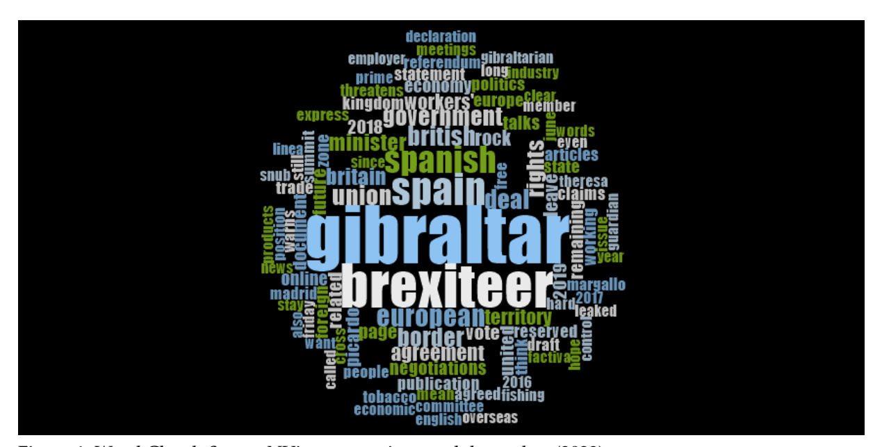
Figure 1. Word Cloud.

Although previous studies in framing either focus on the content or the effect (De Vreese, 2005), this study focuses on the content analysis of the ten selected news articles. This study, then, uses eleven mechanisms from Tankard mentioned by De Vreese (2001) to identify and measure news framing, which among them are leads, headlines, and quotes selection. By using Word Could and Word Frequency on NVivo, this study finds several words that describe Spain in the Brexit negotiation about the Gibraltar issue.